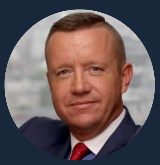
Host Founder LMForums